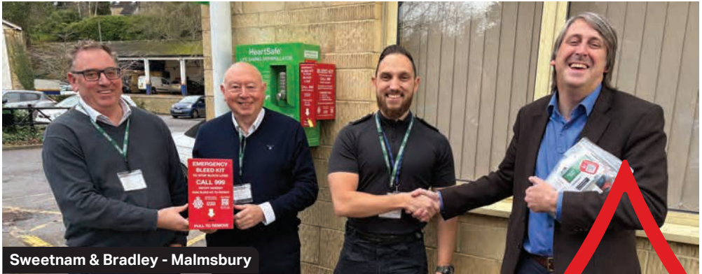
Sweetnam & Bradley - Malmesbury

Inspired by lessons from the 2018 Kerslake Report on the Manchester Arena bombing, the initiative doesn't just react to emergencies - it prepares for them. By prioritising accessibility, simplicity, open data mapping, and public ownership, the Bleed Kit Partnership has created a scalable, sustainable system for community resilience.